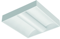
Jupiter Perforated Single